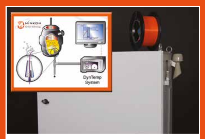
Product advancements and innovation