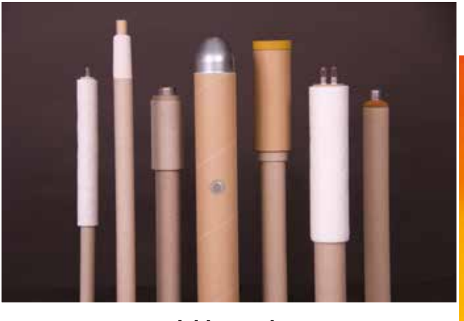
Extensive expendable product range