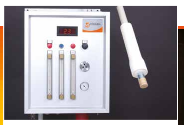
Measurement systems supply, installation and service