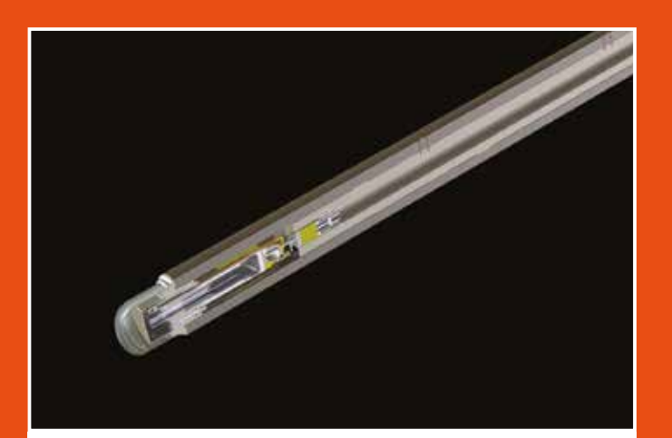
Application specific design and development